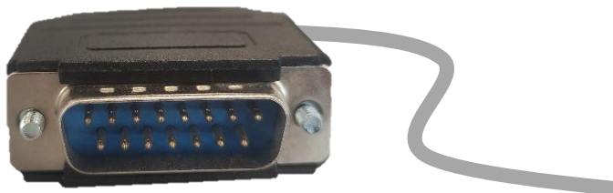
DB15 pins connector for Progetti