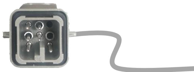
8 pins connector for EP-ELI-02